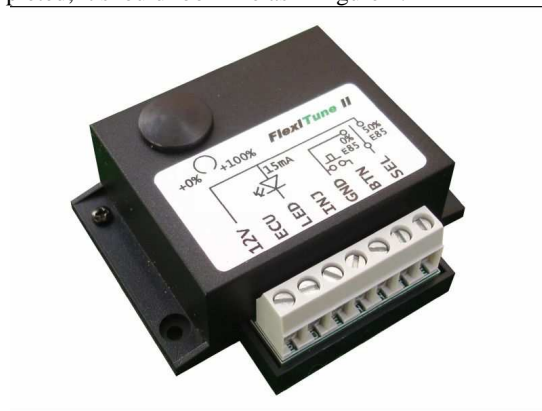
Figure 2: Completed assembled Flexitune

When everything is completed, it should look like as in figure 2.